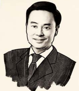
Shee Tse Koon Strategy & Planning